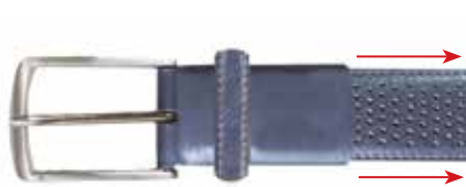
stretch feature under loop