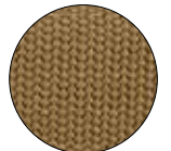
250 khaki with brown tabs