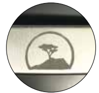
logo detail on loop