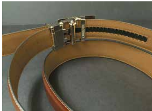
slide mechanism for "Optimum Fit"