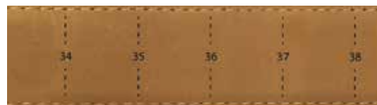
marked to cut for "Personal Fit"