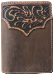
8145000 Color: 210 Tan 0049-2450