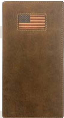
8180000 Color: 210 Tan 0039-1950