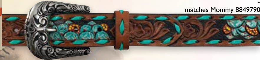
matches Mommy 8849790

9702300 1 1/4" (30 mm) Genuine Leather, floral tooling alternating with a hand painted cactus design, turquoise laced edges, buckle in silver finish. 323 Turq/ Brown 0036-0018