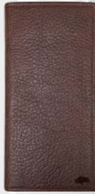
NEW 8197000 Color: 625 Hazelnut Bison 0048-0024