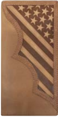
NEW 8188000 Color: 210 Tan 0039-1850