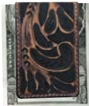
8147000 Color: 210 Tan 0031-1550