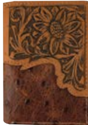
8161000 Color: 200 Brown 0064-0032