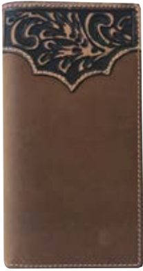
8148000 Color: 210 Tan 0063-3150