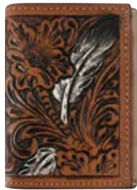
8181000 Color: 200 Brown 0059-2950