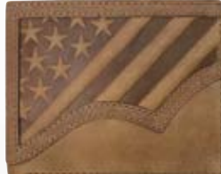
NEW 8186000 Color: 210 Tan 0031-1550