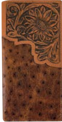
8164000 Color: 200 Brown 0074-0037