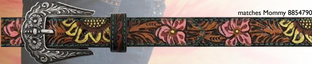
matches Mommy 8854790

NEW 9711300 1 1/4" (30 mm) Genuine leather, embroidered Aztec designs, metal grommets on point end holes, buckle in antique silver finish. 200 Brown 0048-0024