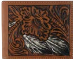
8182000 Color: 200 Brown 0057-2850