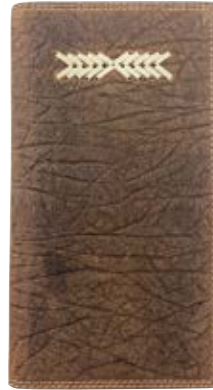
8172000 Color: 219 Brown/Tan 0053-2650