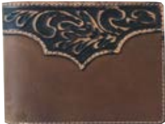
8146000 Color: 210 Tan 0049-2450