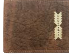
8170000 Color: 219 Brown/Tan 0045-2250