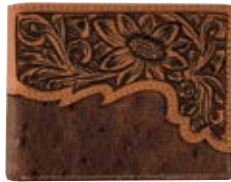
8162000 Color: 200 Brown 0064-0032