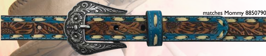
matches Mommy 8850790

9702300 1 1/4" (30 mm) Genuine Leather, floral tooling alternating with a hand painted cactus design, turquoise laced edges, buckle in silver finish. 323 Turq/ Brown 0036-0018