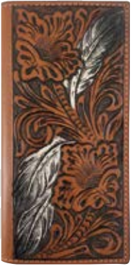
8184000 Color: 200 Brown 0065-3250