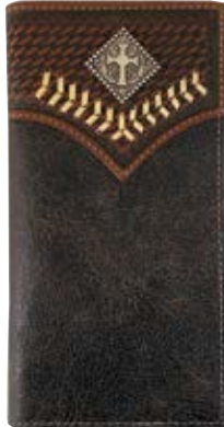
8168000 Color: 200 Brown 0074-0037