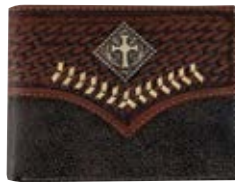
8166000 Color: 200 Brown 0064-0032