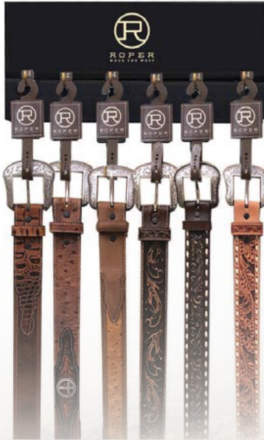
2595000 6 Peg Wooden Wall display with ROPER brand sign. Display holds up to 54 belts. 001 Black

Roper is one of the most recognized western brands in the marketplace today. It reflects a lifestyle that personifies tradition, fashion and style in apparel and accessories.