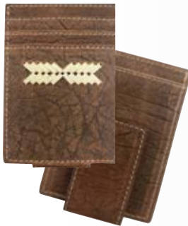
8171000 Color: 219 Brown/Tan 0037-1850