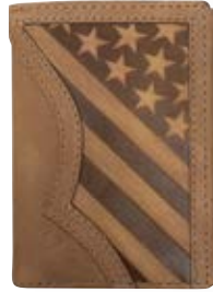
NEW 8185000 Color: 210 Tan 0031-1550