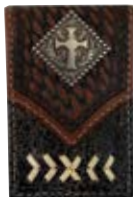
8167000 Color: 200 Brown 0046-0023