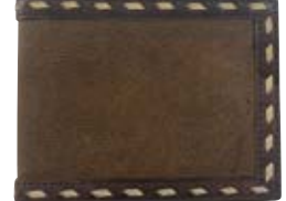
8174000 Color: 244 Tan/Brown 0037-1850