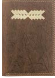
8169000 Color: 219 Brown/Tan 0045-2250