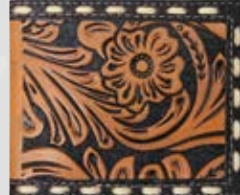
NEW 8190000 Color: 233 Cognac 0067-3350