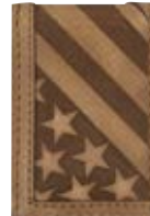
NEW 8187000 Color: 210 Tan 0023-1150