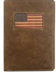
8177000 Color: 210 Tan 0033-1650