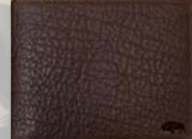
NEW 8194000 Color: 625 Hazelnut Bison 0044-0022