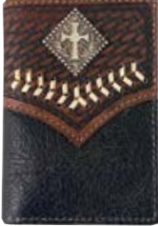
8165000 Color: 200 Brown 0064-0032