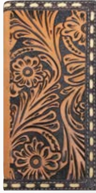
NEW 8192000 Color: 233 Cognac 0077-3850