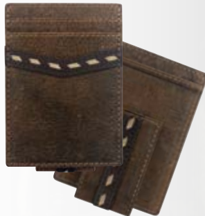
8175000 Color: 244 Tan/Brown 0035-1750