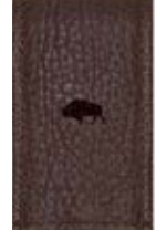
NEW 8196000 Color: 625 Hazelnut Bison 0025-1250