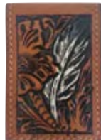
8183000 Color: 200 Brown 0039-1950