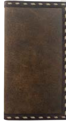
8176000 Color: 244 Tan/Brown 0047-2350