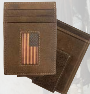
8179000 Color: 210 Tan 0033-1650