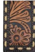
NEW 8191000 Color: 233 Cognac 0047-2350