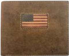
8178000 Color: 210 Tan 0031-1550