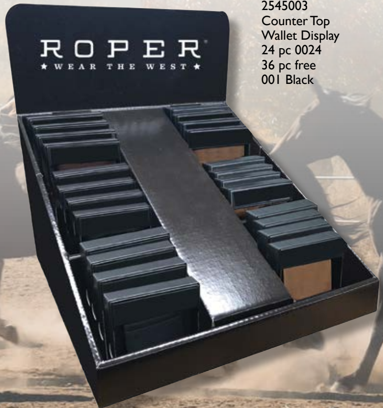
2545003 Counter Top Wallet Display 24 pc 0024 36 pc free 001 Black