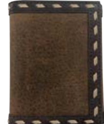
8173000 Color: 244 Tan/Brown 0037-1850