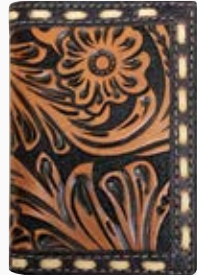
NEW 8189000 Color: 233 Cognac 0067-3350